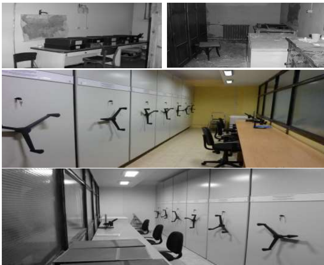
Figure 1. Halls II and III (Plantae) before (a,b) and after (c, d) the reconstruction

Repair of herbarium depots is accomplished by project grand № 20-08 (AU-Plovdiv). Equipment with mobile racking systems and online public catalogue were made possible by financial support of the project "Development of National Centre of Excellence in Biodiversity and Ecosystem Research - CEBDER" (National Fund "Scientific Research" ( http://www.ecolab.bas.bg/cebder )).